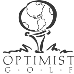
Optimist International Junior Golf Championships logo